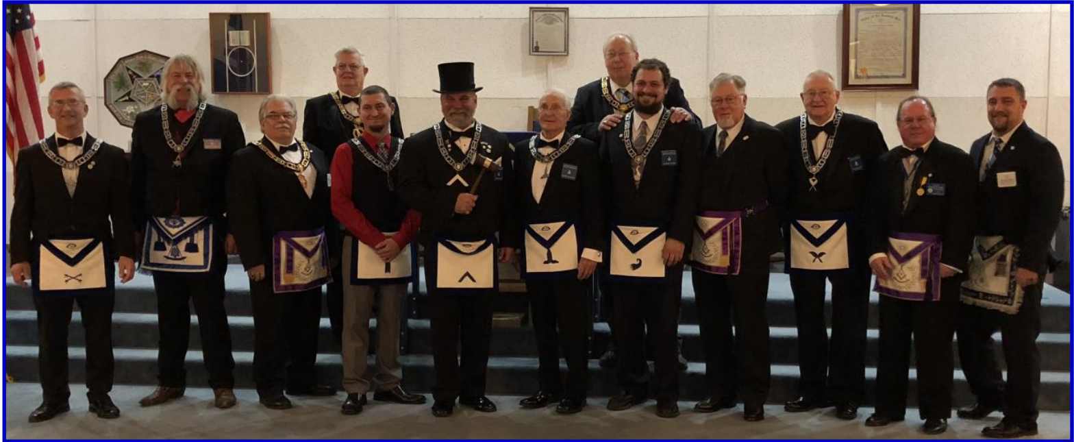
Installation at Sequim Lodge #213 January 13, 2018