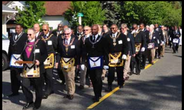
Unity March & Joint Church Service - Dupont Washington