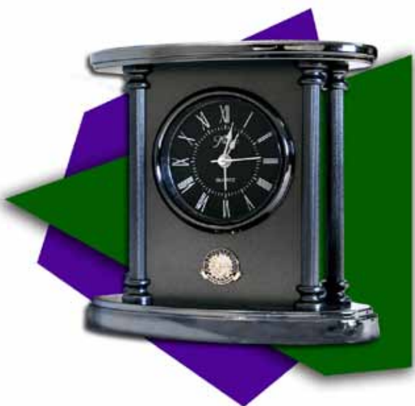
2011 GM Commemorative Clock