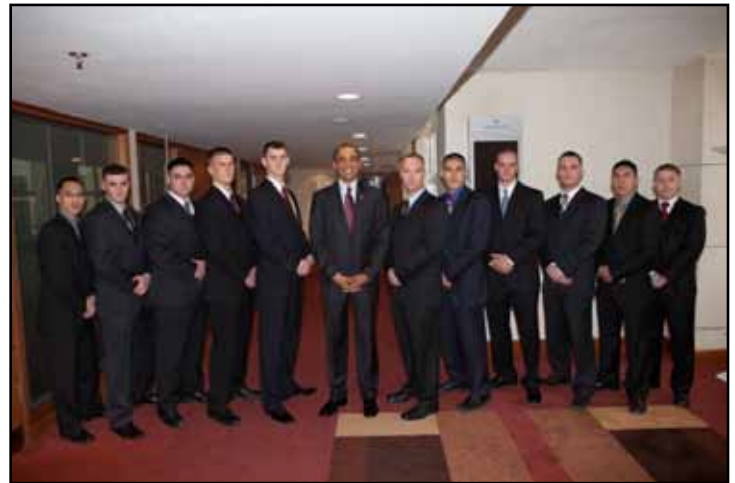
He is to the immediate right of President Obama.