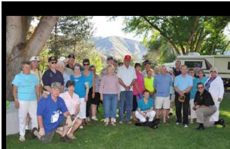
Masonic Jamboree - Monitor, Washington