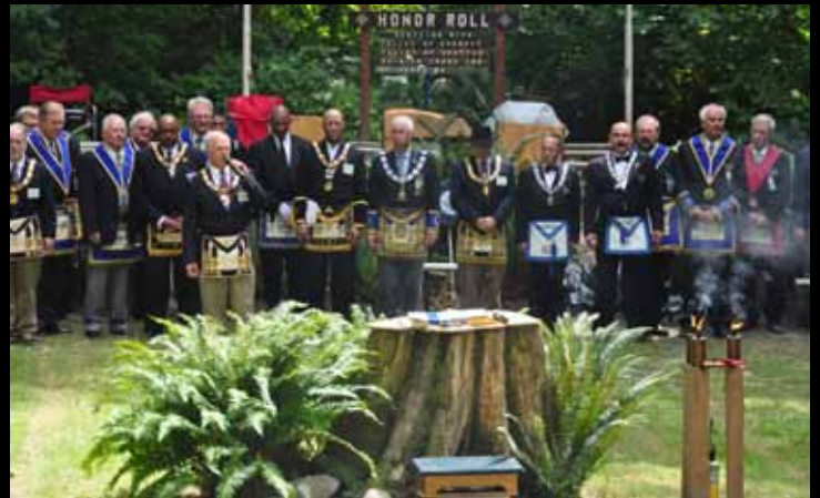
Master Mason - Open Air Degree - Granite Falls